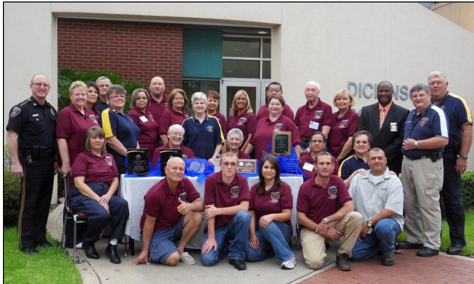
Dickinson (Texas) Citizens Police Academy Class 20