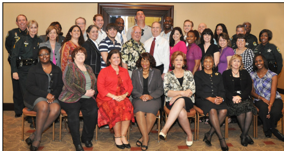
Leon County (Florida) Sheriff's Office CA Class 22 and 23